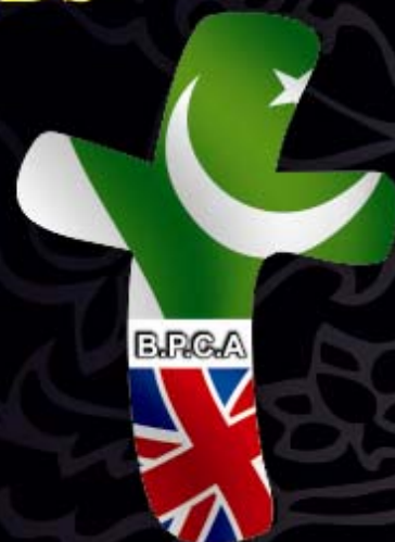
British Pakistani Christian Association

Closing Date For All Entries 15th October 2012